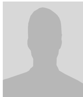
Photograph of certificate holder