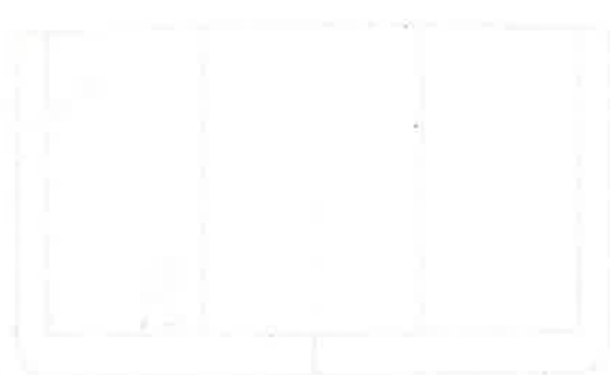
Figure 8 on page 21 of Annex 16 entitled "Reference Double Hull Design No. 4 - Deadweight: 283 000 tdw" should be replaced by the attached.